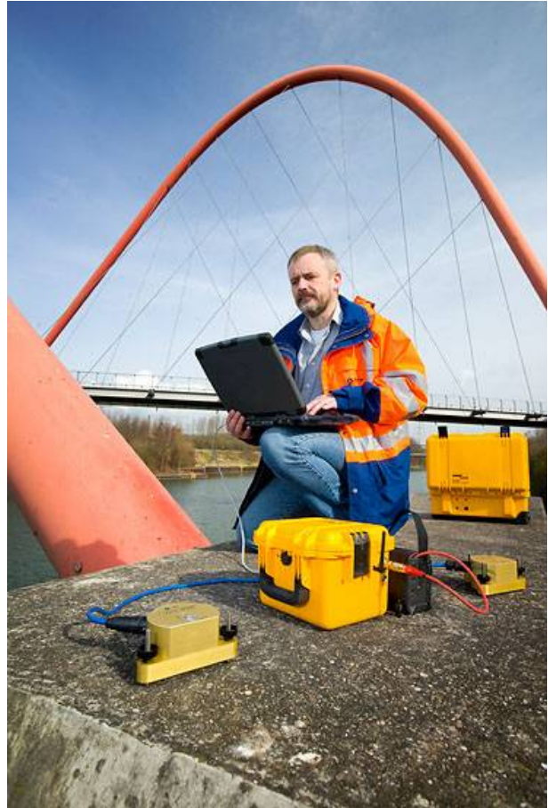
Instrumentation at a bridge base plate