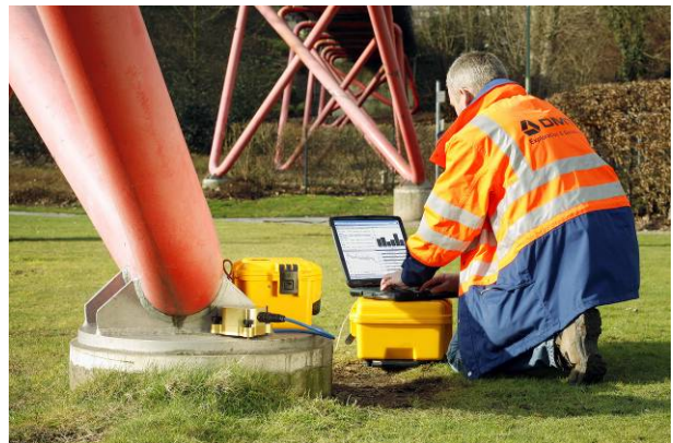
Monitoring of footings

DMT GmbH & Co. KG Exploration & Geosurvey