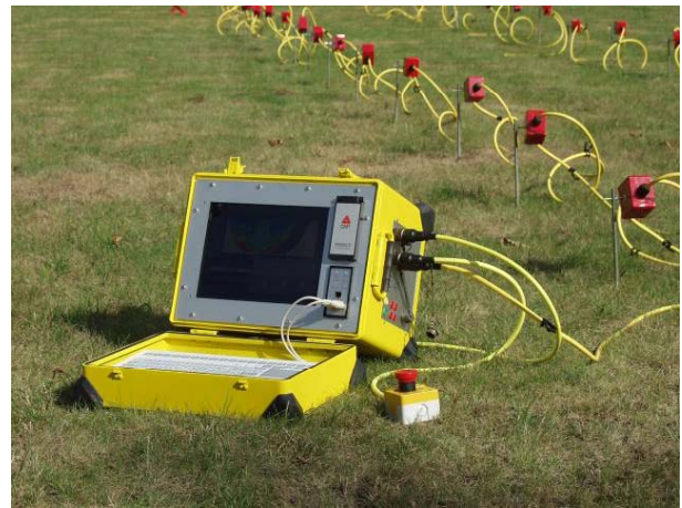
Typical field installation