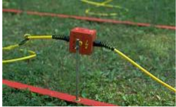
Up to 960 electrodes

DMT GmbH & Co. KG Exploration & Geosurvey