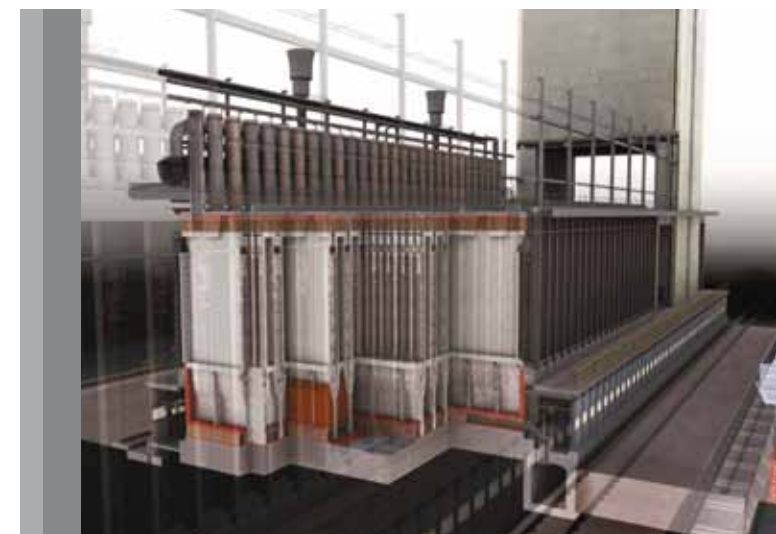
Virtually opened heating chambers of a coke oven battery