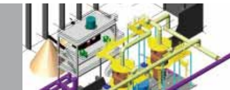
Plot of an ammonium sulfate plant

Completion: October 2007 Project duration: 11 months