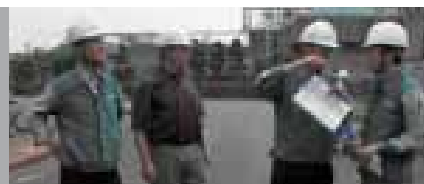
Site visit in Gwangyang, Korea