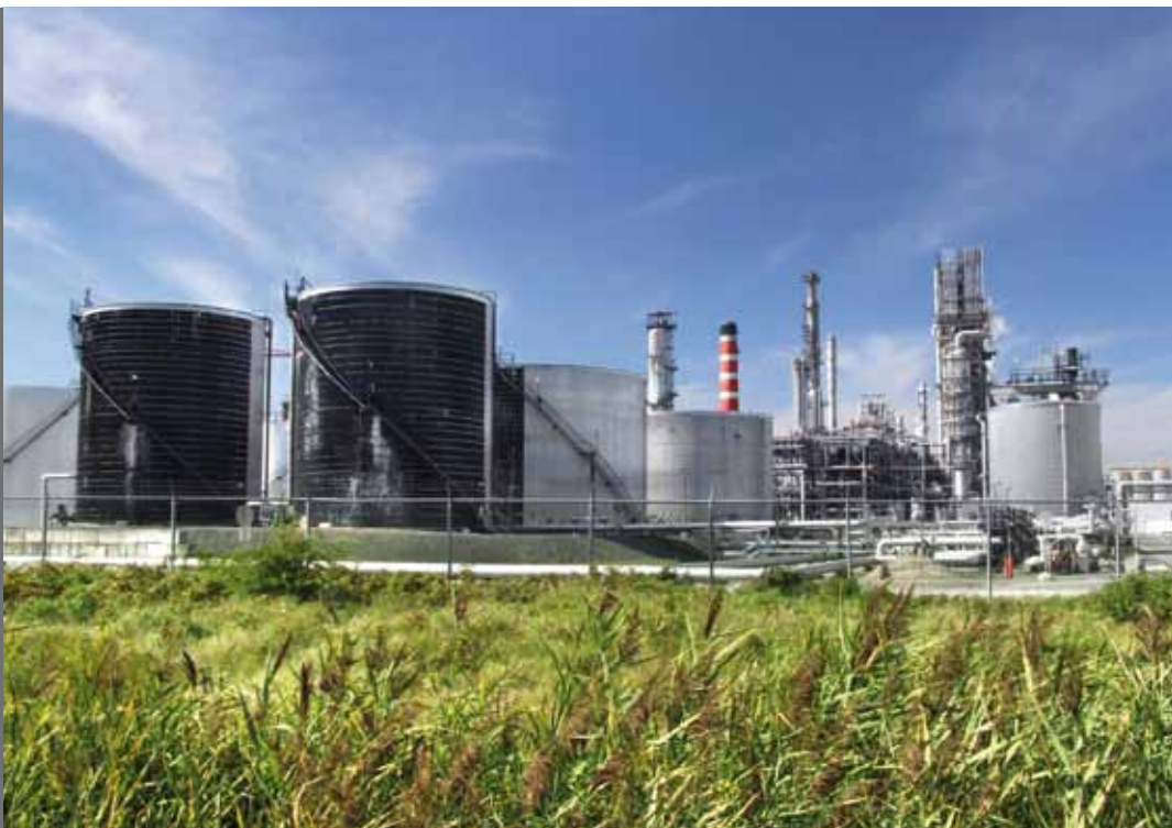
Major oil refinery

Additional costs and effort are always the consequence of unexpected technical failures. In the interest of avoiding events like this, DMT has developed a special maintenance tool oriented strictly on long-term benefits and operational needs.